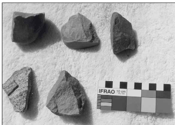
Figure 1. Hammerstones used in the production of petroglyphs at Toro Muer-to, Bolivia.

because their stratigraphical position is likely to tell us roughly at what time petroglyphs were made at the site (Bednarik 1998a). And yet, worldwide there are only very few reports of archaeologists finding and recognising these tools (Edwards 1964: 650; Wilman 1968; Anati 1976a: 41, 1976b: 28, 1981: 14–15, 1994: Fig. 40; Kearns et al. 1975: 325; Ives 1986; Wallace & Holmlund 1986: 26; Moore 1992; Arcà 1995: Fig. 112; Bednarik 1998a, 2001: 39–41; Bednarik et al. 2005). The thousands of other such deposits excavated, usually in the hope of exposing rock art below ground in order to determine mere minimum dates for the art, were essentially misguided and counterproductive: in the vain quest to date the rock art the evidence that would have provided secure dating was destroyed or discarded.