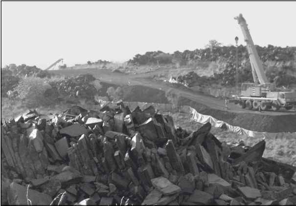
Figure 2. Rock art destruction on an industrial scale: Dampier Archipelago, north-western Australia, February 2007.

except Antarctica. Outstanding examples can be cited from Portugal, where whole valleys containing hundreds of sites were destroyed with the collaboration, acquiescence and even advancement of archaeological agencies (Bednarik 1995a, 2004; Gonçalves 1998; Arcà et al. 2001). In Chile (Bustamente 2006), Australia (Bednarik 2006b) and many other regions, archaeological consultants are generously rewarded by developers to destroy rock art and other cultural sites, sometimes on an industrial scale (Figure 2). In countries where much of the human past refers to indigenous or traditional societies, their descendents object vigorously to this cultural vandalism, but usually with little effect. Indigenous also object to the archaeological interpretation of their past, and to its usurpation by the occupying states and their archaeologists (Bednarik 2013).