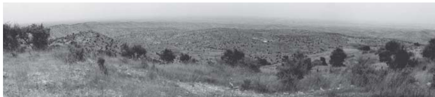
Figure 1: Panorama of the annular geomorphological structure

The caldera-like annular geomorphological structure is located in South Morocco, 8 km east of Agadir in a landscape called Tagragra. It is situated between the shore of the Atlantic Ocean (distance: 13 km), the Souss River (distance: 5 km) and the western Atlas Mountains (distance: 2 km). All ruins and monuments found in situ are located either on a hill inside the annular geomorphological structure, or on the surrounding ring of hills. The geological origin of the structure appears to be an anticline. It has a diameter of ~ 3 km (~ 5 km including the surrounding ring of hills) and strongly resembles a crater, although no evidence of volcanism has been found in this particular area (Ambroggi, 1963). On the central hill several dried up springs are located. The surrounding hills are 100-255 m in height.